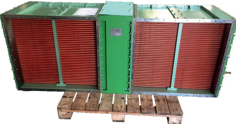
Plate Heat Exchangers;

We can manufacture any type of (replacement) heat exchanger such as shell & tubes, air coolers, plate heat exchangers etc. We can calculate complete new heat exchanger or offer replacement heat exchangers anywhere in the world. Best quality with the best price guaranteed.