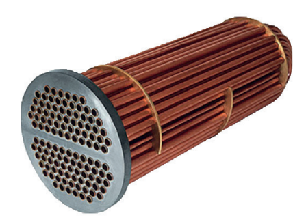
Chemical cleaned tube tundle.