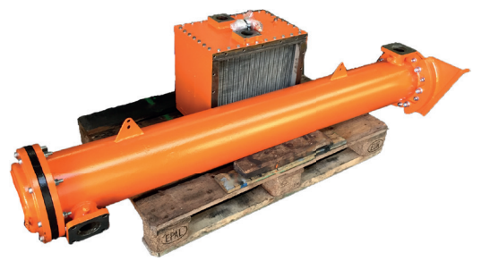
Overhauling of an inter cooler and oil cooler (shell & tube), painted in customers colors.