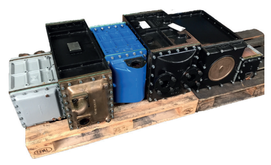
Overhauled and u ultrasonically cleaned air coolers.